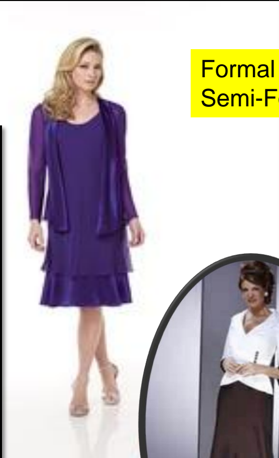
Formal or Semi-Formal