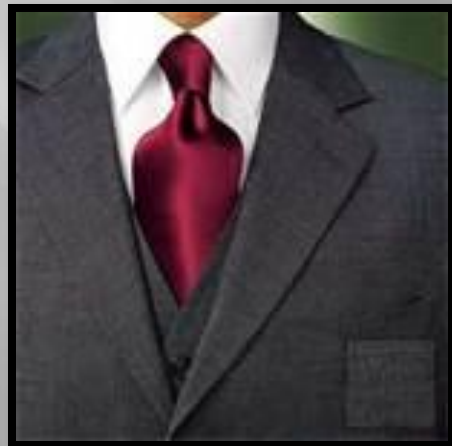
Formal Event: Tuxedo or Suit