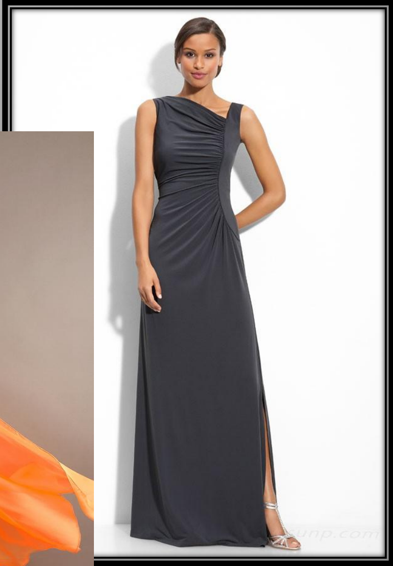
Appropriate floor-length gowns for Formal Events