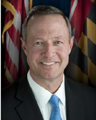
MARTIN O'MALLEY GOVERNOR

STATE HOUSE 100 STATE Circle ANNAPOLIS, MARYLAND 21401-1925 (410) 974-3901 (TOLL FREE) 1-800-811-8336