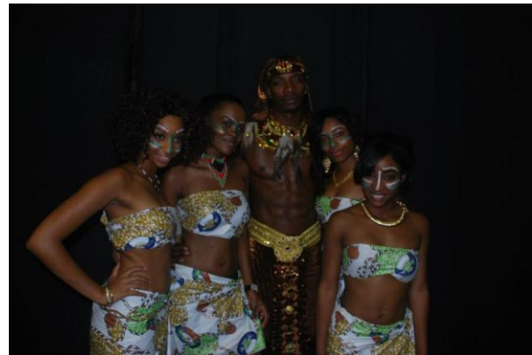
NABTRY INTERNATIONAL DANCERS